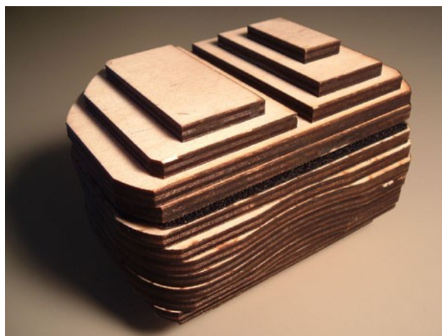
Figure 1. The ROCK

The ROCK itself is not an instrument, but rather a control interface for the software. It is made of 16 laser cut plywood layers of various shapes and sizes that are glued together to produce the final form which houses the electronic components. Inside, a small circuit board consists of a piezo vibration sensor, an ATmega32 chip [1], and an Xbee-PRO [2] wireless transmitter. The vibration sensor converts the motion of the ROCK into voltages that are converted into digital signals via the ATmega32. Afterwards, they are forwarded to the wireless transmitter and finally sent to the computer.