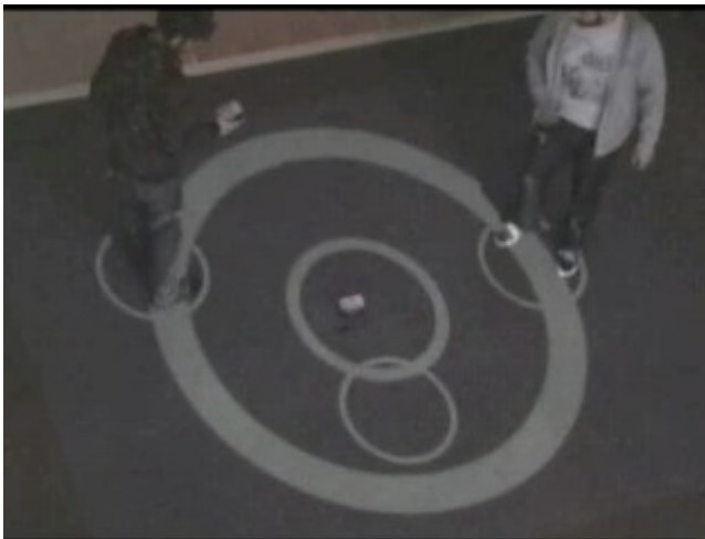
Figure 3. The Installation and Visuals

To track the location of the users we use an web camera with the infrared (IR) filter replaced by a visible light filter. Two large flood lamps bathe the stage in IR. This allows for projection in the visible light spectrum and without interfering with the tracking in the IR spectrum. Eyepatch [3], a computer vision tool, tracks the users based on light intensity (humans absorb IR creating dark spots). Eyepatch does blob detection and sends out the location of the blobs over TCP/IP in XML.